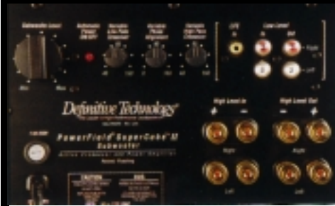
These listings are based on the manufacturer’s stated specs; the HT Labs box below indicates the gear’s performance on our test bench.